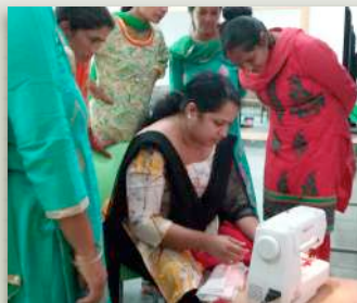
A peer workshop in tailoring where sartorial enthusiasts from the local community and campus exchanged notes.