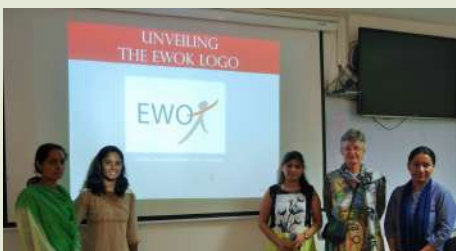
Unveiling of the EWOK logo.