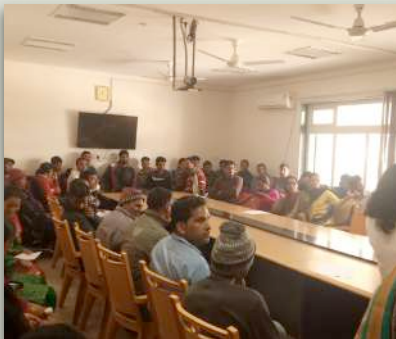
Local farmers turn up in large numbers to learn about schemes from the Horticultural Dept.