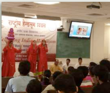
The EWOK team spoke on the handloom culture in the Kamand valley at the National Handloom Day 2017 celebrated in IIT Mandi.