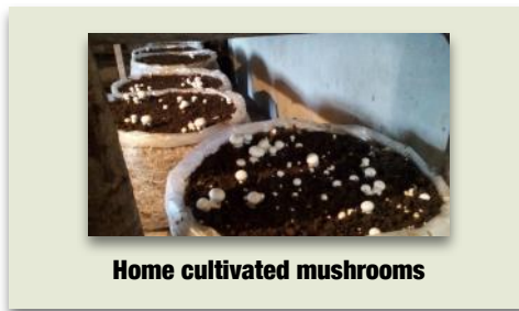
Home cultivated mushrooms

The EWOK team now includes a small network of campus residents willing to guide the local women's endeavours. While the women figure out what business to get into, the mentors provide inputs to the varying needs of the market inside IIT Mandi and beyond, offer technical advice and guidance to find financial assistance, training etc. Mentors choose to work on a particular line of service or production with local women sharing their interest.